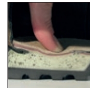
HAIX® MSL System