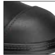
RTC with countersunk seams