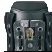
HAIX® Lacing System