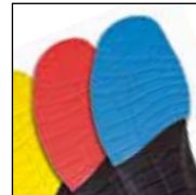
HAIX® Vario Wide Fit System