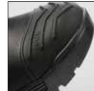
HAIX® High Durability Cap System