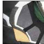
HAIX® AF System