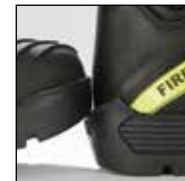
ES Out System