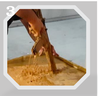
MUD TEST (LEVEL 12 ULTIMATE TEST)